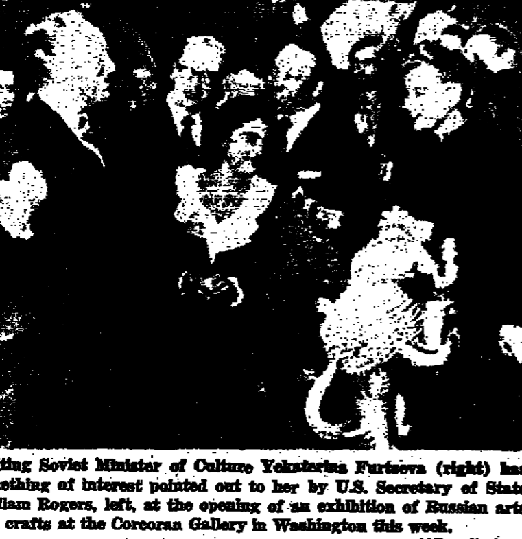
Soviet Minister of Culture Yekaterina Fursova (right) has something of interest pointed out to her by U.S. Secretary of State William Rogers, left, at the opening of an exhibition of Russian arts and crafts at the Corcoran Gallery in Washington this week.